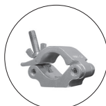
68620 Truss clamp vertical